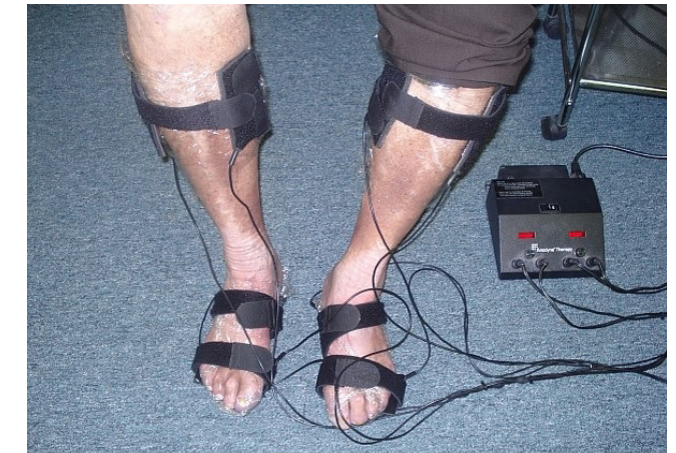
Figure 1: Application of the Anodyne Therapy System (ATS).

The infrared light therapy treatment was applied to the feet and legs of study participants (Figure 1), offered 3 times per week for 30 minutes per day, over 5 weeks. The light therapy intervention was performed using the Anodyne Therapy System (ATS) Model 480 (Anodyne Therapeutics LLC, Tampa, Florida). The ATS is a medical device consisting of a base power unit and therapy pads