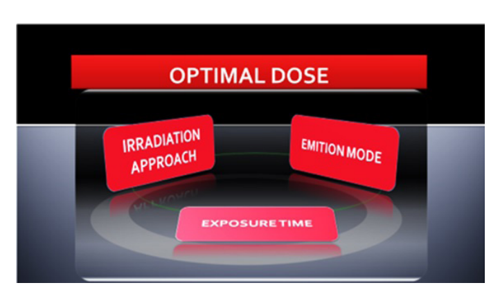
Figure 2: Schematic illustration of the methodical approach for choosing the optimal dose of laser radiation individually for each patient and for each stage of treatment.

World literature provides information on scientific controversies and fluctuations at the recommended optimal dose of electromagnetic radiation on the human body. It has been shown that tissue reactions are variable in nature under the influence of different physiological internal and external states in the dynamic