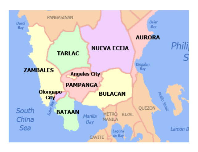
Figure 3: Location Map of Department of Public Works and Highway- Region III District Engineering Offices