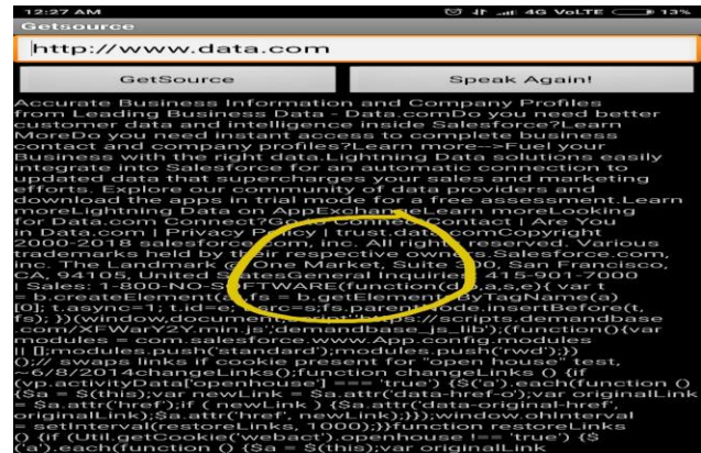
Fig.3. Gesture to start TTS

The following Figures shows the gesture to start TTS.