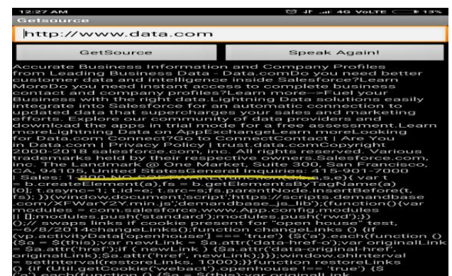
Fig.4. Gesture to stop TTS

The following Figures shows the gesture to stop TTS.