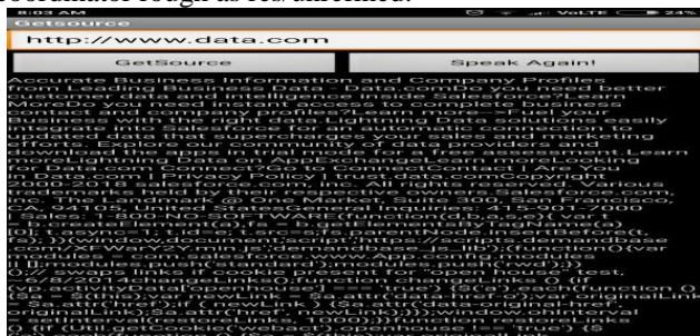
Fig.2. Retrieval of Content

In case the apparently tried requirements to hear a comparative word or same sentence; they won't have options for that. Movements can be used to offer decisions to granularity change. Android offers customers to show their own movements and they can use that in their application and give exercises according to the application. A touch screen empowers a customer to interface with an in various a larger number of courses than is possible with a keypad. Customers can tap, drag, journey, or slide visual segments in order to play out an arrangement of assignments. The Android framework makes seeing essential material data basic, for instance, a swipe, however seeing more personality boggling signals is all the more troublesome. Android and later joins the package android.gesture. For complex flag affirmation. This API stores, loads, draws, and sees gestures.on. The signs can be displayed using Signal Builder Application. By using Gesture Builder, the customer can display their own specific flags and name them. The signs are secured in the sd card at the zone File Explorer/mnt/sdcard/movements. The movements record can be pulled to our wander by a coordinator rough as res/unrefined.