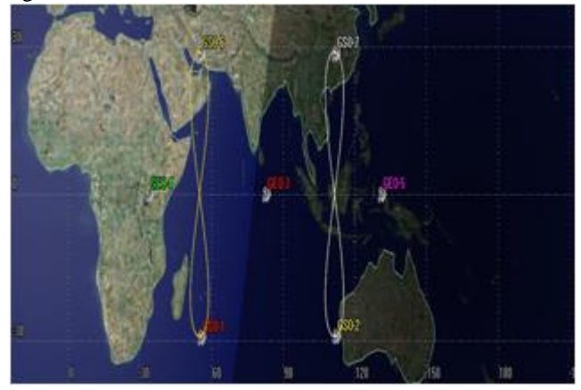
Fig.1. Ground track plot of IRNSS satellite's

One of the major applications of navigational systems is to determine the correct position of the user/ ground station positioned on the Earth [1]. In order to achieve accurate user position, it is first required to know the precise orbit of the navigational satellites.