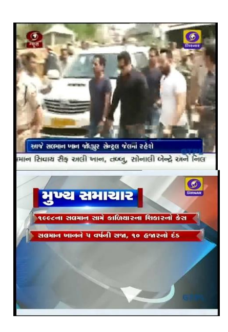
Figure 3. Top 6 results retrieved on query text " સલમાન"