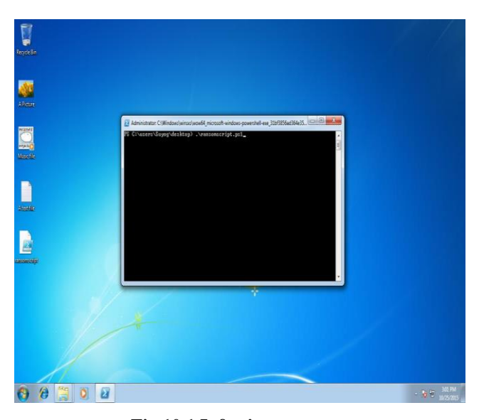
Fig 10.1 Infection anatomy