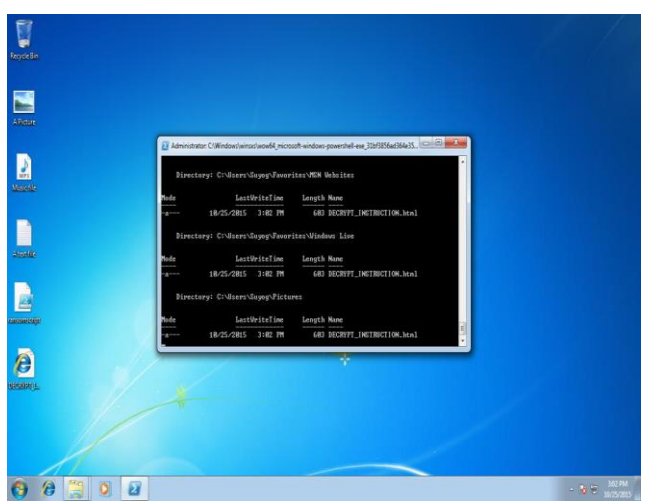
Fig 10, 2 Execution anatomy