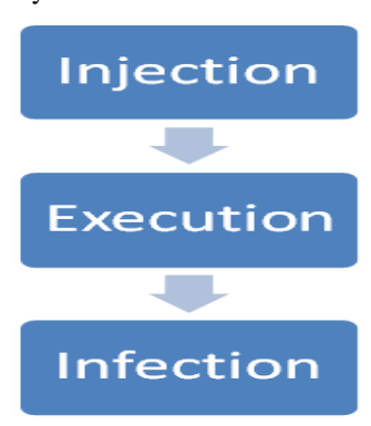
Fig. 5.1 working of attack

First it is very important that to understand how attack actually works. Looking to the facts of its damage, it is evident that ransom ware is not like any other attack, which can be easily detected and prevented by putting/tuning some security products, but it is much more than that. Shown in figure [5.1] As per our preliminary research, we have divided the entire process into phases which will give a clear understanding of the same. The proposed paper has explained the working and the authors have divided the working into three main parts that is the first step is attack here the injection to the system with