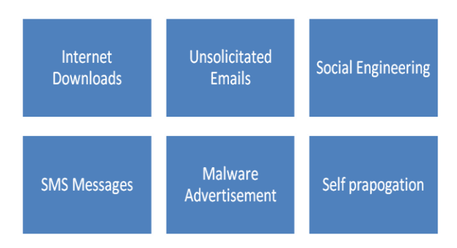
Fig 4.1 Entry points of Ransom ware