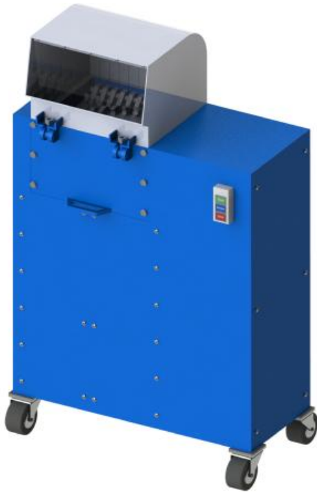
Figure 2: Unit 1 & 2 Prototype Design

(4) Orifice which regulates the flow of shredded foams from the foam cutter assembly and mesh down to the bin/ foam collector; (5) Stand Assembly which supports the whole assembly of the machine (eg. Foam cutter assembly, body plate assembly, motor, hopper); (6) Lock Assembly ensures that tapering and unauthorized access to the foam cutter and body plate assembly are not possible; (7) Hopper Assembly that protects the operator from accidental feeding and improper feeding procedures; (8) Three-button switch which toggles the on and off of the machine; (9) Control Panel where the electronic and overload feature are reinforced to the machine; (10) Wheels for support for easy transport; (11) Mesh Assembly which serves as a replaceable filter and quality control of the size of shredded foams aligned to the requirements of the end user.