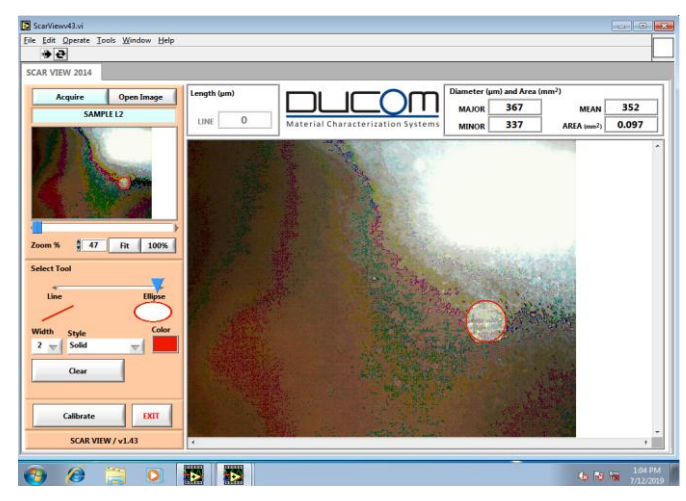
Figure 3. Image of Ball 2 of Best sample L