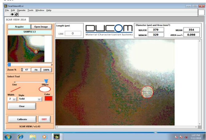
Figure 4. Image of Ball 3 of Best sample L

The test was also done for load carrying capacity of mineral oil and best sample L on four ball tester using ASTM 2783D standard [9]. Extreme pressure results stated that pass load and weld load for base oil (SAE 15W40) are 150 and 200kg respectively whereas for best sample L (1wt% of all nanoparticles) has 200 and 250kg pass ans weld load. The results have improved because of nano additives in mineral oil.