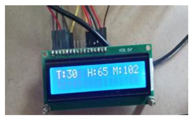
Figure 8(b): Output readings of Temperature Humidity and Moisture content of the soil