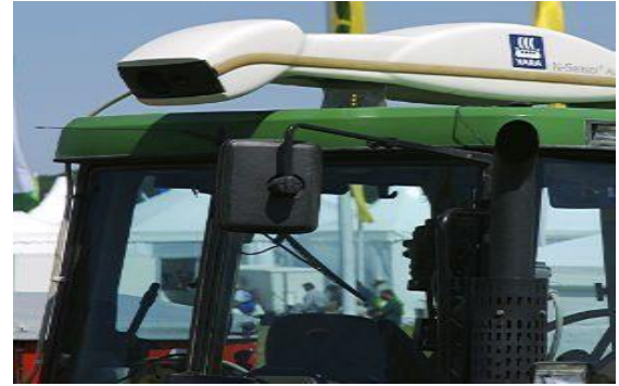
Figure: Modernized Agriculture system