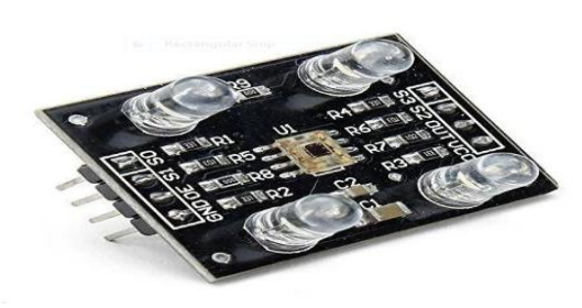
Fig 6: Color Sensor

This project is interconnected with both hardware and software. The hardware consists of Arduino Uno with an inbuilt Microcontroller, Moisture sensor, DHT11 sensor, PH sensor, and GSM module whereas software includes Embedded 'C', Eagle software for PCB designing. Then we will connect the components to the Arduino Uno. The power supply will be automatically supplied from the Arduino Uno of 5V. Also, connect the Arduino Uno to GSM Module to deliver the SMS for the Farmer. After ensuring that the given connections are correct, then its corresponding code will be dump into the microcontroller so that the dumped code won't get erased until and unless another code will get dumped. Thus, the accurate results will be displayed on the LCD as well as message will convey to the farmer accordingly.