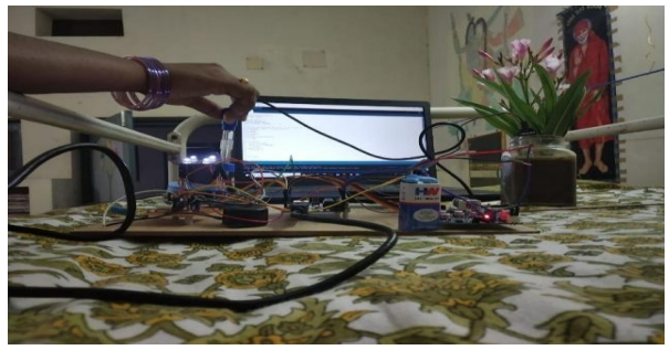
Figure 8(a): Experimentation of this project