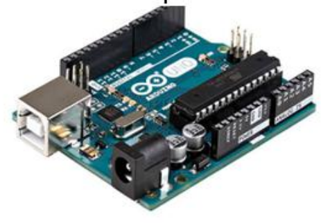
Fig 2: Arduino Uno

Arduino Uno[7] is a microcontroller that is referred to as an actual mini-board. It has various types of pins i.e; analog and digital pins. There are 14 digital and 6 analog pins. Usually, it uses the power 7 to 12 volts for working through the USB cable.