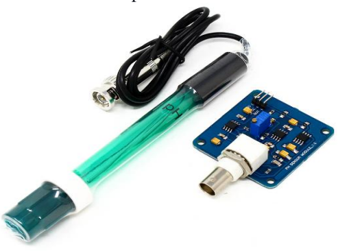
Fig 5: Ph Sensor

The solutions having pH value between 0 to7 are acidic solutions with large concentration of hydrogen ions whereas solutions having pH value between 8 to14 have basic solutions with small hydrogen concentration .The solutions having pH value of 7 are neutral solutions. In this process we can detect the pH levels in the soil.