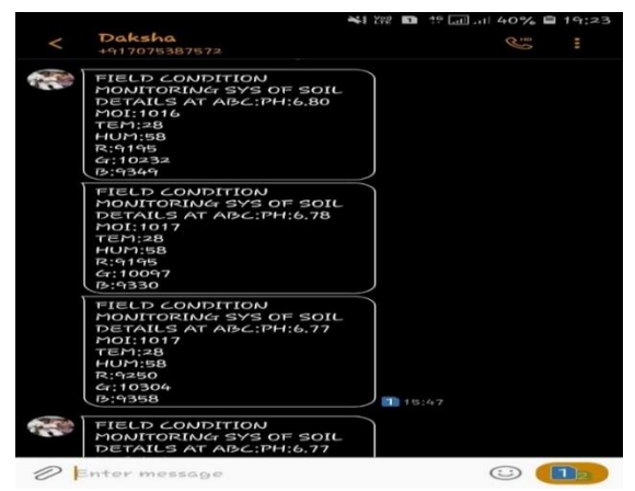
Fig 8(c): Updated information to the farmers via; SMS.