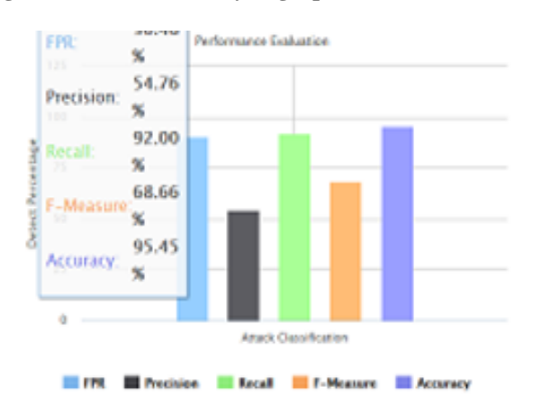
Fig 3. Improved Accuracy, precision, Recall.