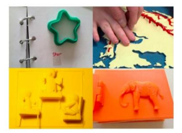
Picture 3 On top constructions by hand 2.5D-ATP/ATG At the bottom 3D Printed 3DP-ATP (Stangl, Hsu, & Yeh, 2015)

The design of 3D printable tactile images (3DP-ATPs) for visually impaired young children has the potential to significantly increase the supply of tactile materials that can be used to support the emerging development of literacy skills [25].