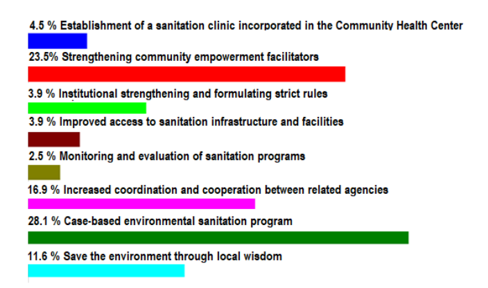
Fig. 3. Policy Priorities

Of the eight alternative related policies, the policy will be obtained as a priority in succession as follows: environmental sanitation Program based on case studies (28.1%), strengthening community empowerment facilitators (23.5%), improved coordination and cooperation between related agencies (16.9%), environmental rescue through local wisdom (11.6%), increased access to infrastructure and sanitation facilities (8.9%), forming a sanitation clinic incorporated in the Public health center (4.5%), strengthening institutional and drafting strict rules (3.9%), and Monitoring and evaluation of sanitation programs (2.5%). Three policies that are prioritizing in drafting a sanitation-based environment setup can be realized with the following strategies: