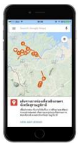
Fig. 3 Usage via mobile applications