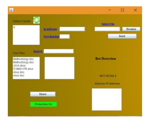
Fig 1.3 Details of file or data transfer

The details of the system that is sending the data or file to the other system