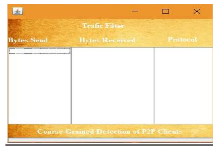
Fig:1.2 Send and receive details of Bytes

The above screenshot illustrates about the bytes sending and receiving details using the coarse grained detection of P2P clients