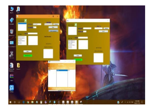
Fig 1.4 Setting the protection mode: ON

The details of the system that is sending the data or file to the other system