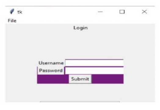
Fig. 2 Login GUI

The GUI module is used to collect what the client needs and these go into the recommendation engine from where requirements are recommended to the user. A questionnaire is prepared of every user which the user answers and these what recommendations answers decide will be recommended to that user based on what users have previously used. In this interface itself will in the end the final SRS will be generated that the user can use for documentation purpose, etc. GUI has been developed using Eclipse IDE, Version: Eclipse IDE 2018-12.