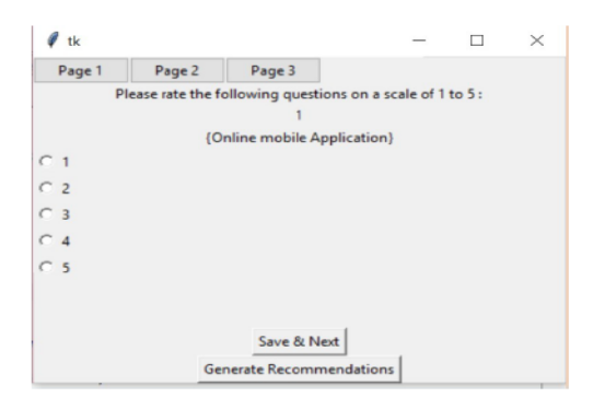
Fig. 3 Questionnaire GUI