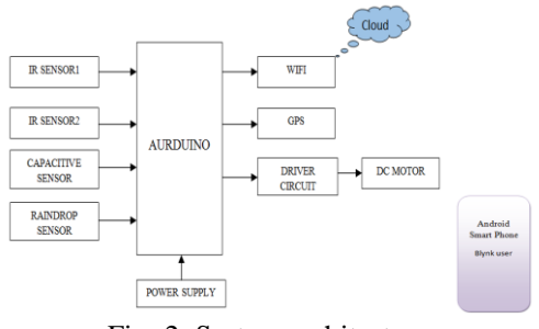
Fig -2: System architecture