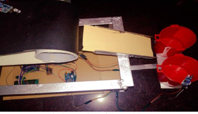
Fig 4: Top view of the model