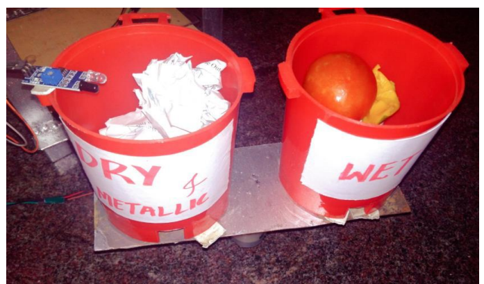
Fig 5: Collection of waste in bins