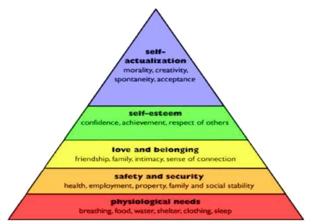
Fig.1: Maslow's Need Hierarchy (Maslow, 1965)

which include the last level, which is called Self-actualisation, it is the last level that the employees can reach, within feel full motivation and satisfied (Smith,2003). A cycle of motivation, support employees to be satisfied with their work, is ongoing and never reach ending beside it is varied, complex and fluctuating. Thus, theories of human motivation should be aware of it (Smith,2003; Upadhyaya; 2014; Osman et al,2017)