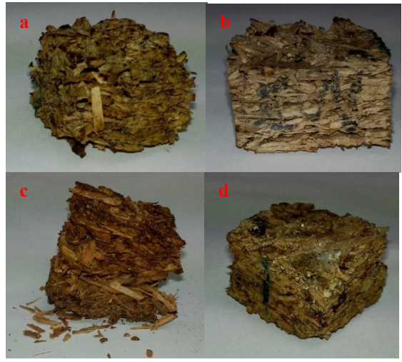
Fig. 2: Visual appearance of particleboards bonded with different binding agents after exposure to Coptotermus curvignathus : (a) 10% UF; (b) 10% UF + 20% PO; (c) 15% CA and (d) 15% CA + 20% PO + 20% FA

the samples stayed intact except some nibbles on the surfaces.