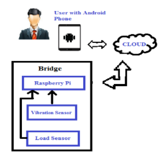
Figure 1: Architecture of Bridge Monitoring System

The next sensor we are using is a load sensor. Load sensor is used to check the weight on the bridge. For any bridge one can specify a threshold limit on the amount of load that it can handle for the safe operation. If the weight exceeds the toleration level, then it leads to bridge collapse. To avoid this we are placing load sensors at the entry and exit points of the bridge in either direction.