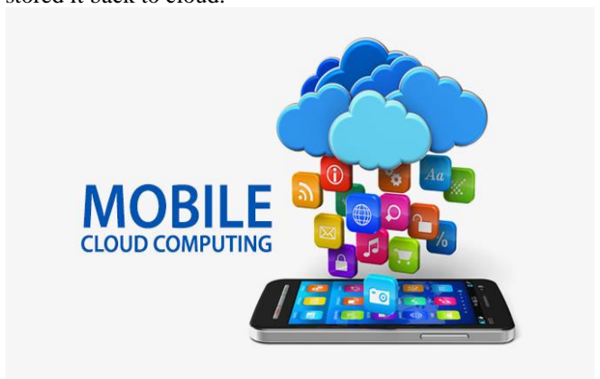
Fig (4). Mobile Cloud Computing

This is where the need of Mobile Computing has come into existence as number of apps are getting increased the need for the Storage and processor speed increased.[1]The companies started developing the different apps by creating the need among mobile users. Apart from this people are fond of Games and Social Networking sites. These are consuming so much of space which again raised the need of huge memory in the mobile.[2] The companies cannot increase memory just like that because there are some factors associated with this. The alternate for this,People started using Cloud Space in order to store the Data and process it whenver it is essential. TO give an Example all the photos and documents of the user instead of storing them on mobile phone they will be stored on cloud when and when there is a need that will be accessed and stored it back to cloud.