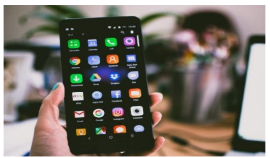
Fig (3). Android Smartphone

Once the Android Operating System came into the picture the entire structure of Mobile Phones changed, Started calling them as Smart Phones. Where in this Smart Phones everything will be running based on the applications.[1] The Culture of Applications Started, it increased the usage of Mobiles Phones and also opened doors for technocrats to develop applications as per the need of the customer. As Android is an opened doors not only to the Technocrats and also for the business people where so manystart-ups started to develop android applications and sell them in play store.[2]