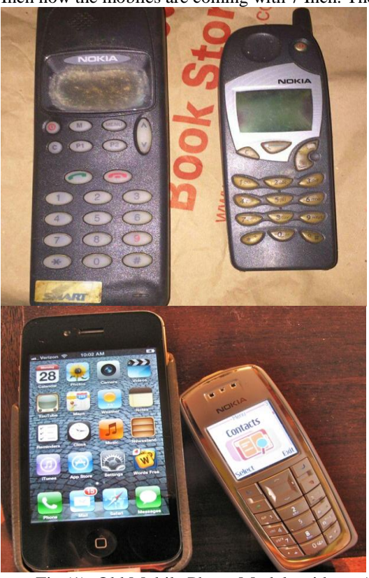
Fig (1). Old Mobile Phone Models without Android Operating System.

almost 256GB which is equal to a laptop storage space 5 to 6 years back. In the same way the display it is 1.5 Inch to 2.5 Inch now the mobiles are coming with 7 Inch. The following