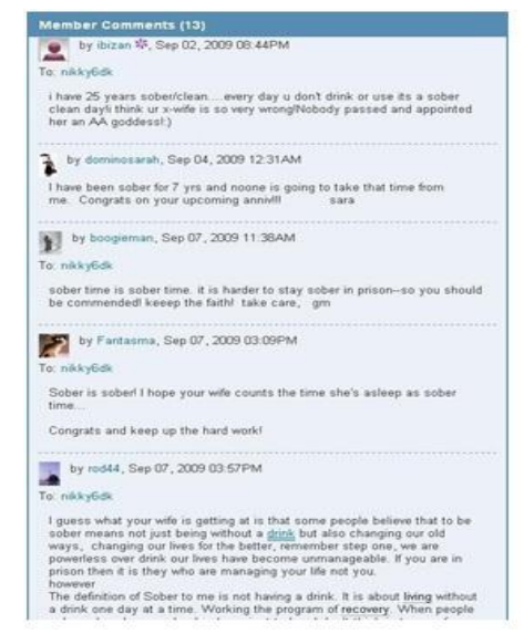
Figure 1. Sample Comments from MedHelp Forum

From MedHelp an informational index has been produced for a time of a twelve months through gathering all communicate load up posts and client profiles, which joins of in extra of 7,000,000 messages whole of each query and solutions posted with the asset of over one million actual customers in approximately 1.7 million strings. It consists of all posts in a from 320 pre-characterised gatherings and 857 consumer made customized gatherings, included at the characteristic of the profiles of 15, 07,357 clients who had allotted at any rate one message in the ones gatherings. From the above customers 7, 05,329 have been people of internet net website online on-line-characterized association and 11, 434 had been benefactors of as a base one placed up in the collecting. most of the customers an entirety of one hundred and seventy,506 kinship connections existed among all clients, out of which 89.7% (131, 753) have been used inside the dataset.