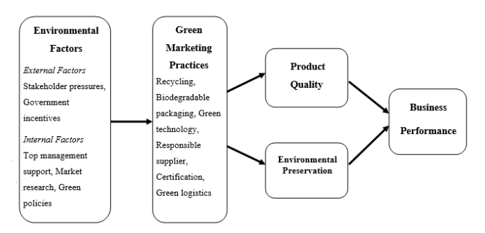
Fig. 1. Conceptual Model

. Fuentes (2015) hypothesised in his ethnographic study of the Swedish food industry that green marketing was achieved through a complicated group of marketing procedures, such as, window dressing, decorating, and trail making, among others. Results identified that eco-products promotion was a performative undertaking which required artistic application. It was also found that green marketing was not a linear, logical, comfortably managed venture, but in fact a complicated, practice-based, and executable project. Bidyarthi et al. (2013) stated green marketing ensures sustained long-term growth, competitive advantage, cost effectiveness in production processes, enhanced performance, and access to new markets. Their analysis covered case studies of diverse Indian industries. Ghodeswar and Kumar (2015) surveyed 220 top and middle level marketing professionals and the sampling frame comprised Indian companies involved in green marketing practices. Green marketing practices that influenced green orientation were found to be eco-sourcing, product innovation, recycling process, green price,