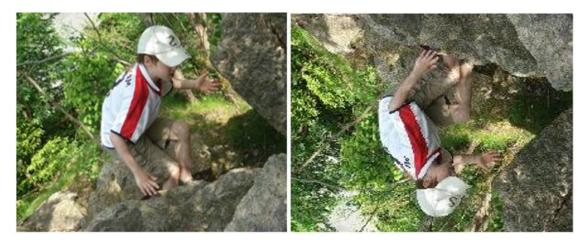
Fig. 8. Before vertical flip

"Fig. 8" and "Fig. 9" show us an image before flipping it vertically and after flipping it vertically.