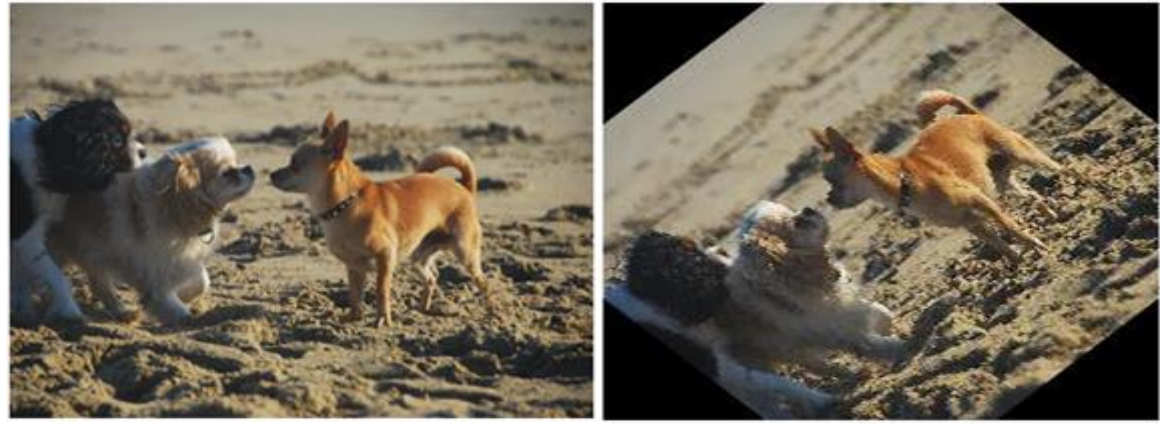
Fig. 12. Before rotation

"Fig. 12" and "Fig. 13" show us an image before and after rotating it by an angle of 45 degrees in the counterclockwise direction.