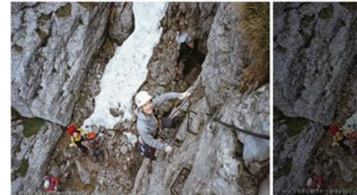
Fig. 4. Before decreasing the brightness

"Fig. 4" and "Fig. 5" show us an image before decreasing and after decreasing the brightness respectively.