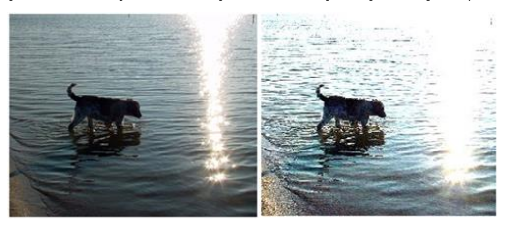
Fig. 2. Before increasing the brightness Fig. 3. After increasing the brightness Table- III: Captions generated by the image captioning model for "Fig. 2" and "Fig. 3"