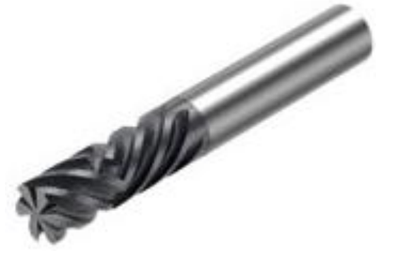
Fig. 1. Dual Helix Tool.

This study has been performed on M/s Lakhsmi Machine works Ltd make LMV JV 55 Vertical milling machine. Three stages of cutting speed (2000, 2500 and 3000 rpm), feed (400, 500 and 600 mm/min) and depth of cut (0.5, 0.75 and 1 mm) are determined. The constant length of cut is 25mm. The solid carbide, diamond coated, dual helix tool shown in Figure 1 has been used for machining. The tool has geometric parameters of 6mm of diameter, 40^{\circ} of helix angle and 6 flute and it is presented in Fig. 1. The 90 x 90 x 5 mm unidirectional CFRP plates are used for slot milling study.