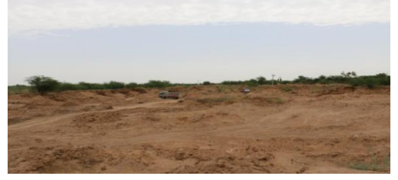
Fig 1: Mine Site at Mitheri River

The location of study area is situated at Mithri River which is branch of Luni River in Rajasthan. The region is enclosed in survey of India Toposheet no. 45 F/11