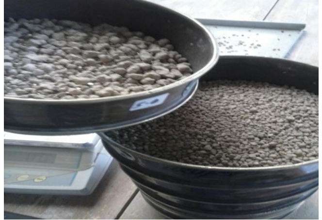
Fig 1. Sieve analysis for Aggregates Source (author 2013)

Experimental study design was employed. The main research method was laboratory research. Samples of concrete mixes containing varying amounts of Kunkur fines were made and subjected to the appropriate tests to determine the optimum amount. This is also Co relational research which aims to examine and describe the relationship between sand and Kunkur fines concrete using laboratory tests. Certain properties of Kunkur were also determined by laboratory tests as explained below. The study adopted the library, field and laboratory tests as the main forms of research.