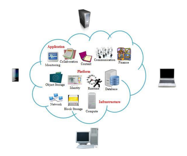
Figure 1. The basic types of service models in cloud computing

Many other types of service models are provided. In storage as a service (STaaS), a service provider leases storage to end users by subscription. In security as a service (SECaaS), the security of a service provider is integrated efficiently and cost-effectively in a cooperative infrastructure. Test environment as a service (TEaaS) is another service provided to users, in which on-demand test environments and their data are given to customers. Figure 1 illustrates the basic types of service models in cloud computing.