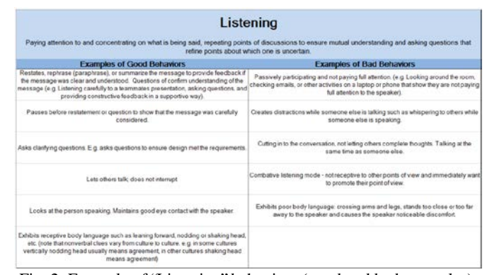
Fig. 2: Example of 'Listening' behaviors (good and bad examples)

During the second step, the initial list of NT skills had their quality assessed and were validated by focus group of experts in industry and academia. Two surveys (and focus groups) were conducted online (using a cross sectional design) to gather NT skill priorities, missing NT skills, description clarifications, and examples of examples of good and poor behaviors for the top rated NT skills of software developers. So that we could prioritize our efforts, focus group ranked the importance of each NT skill to software professionals during the first survey. After the survey analysis, we had a reduced list of 16 skills to focus on. During the second focus group survey, we gather a total of 408 examples of observable actions that indicated good performance and behavior of each NT skill as well as examples of observable actions that indicate poor performance and behavior of each NT skill. These examples were reviewed, clarified, and redundancies were eliminated. The final set of NT skills consisted of: teamwork, initiative/motivation to work, listening, attitude, critical thinking, oral communication, problem solving, attention to detail, flexibility, integrity/honesty/ethics, time management, and questioning. Some behavioral examples, such as "being a good team player" and "body language and persona emitting that you do not enjoy your work", were too ambiguous and removed. It was also felt that the "Leadership" skill did not have enough observable