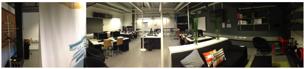
Fig. 3: Software Factory

a) Behavioral Marker System tool and Example Behaviors: Each non-technical skill has its own set of good and