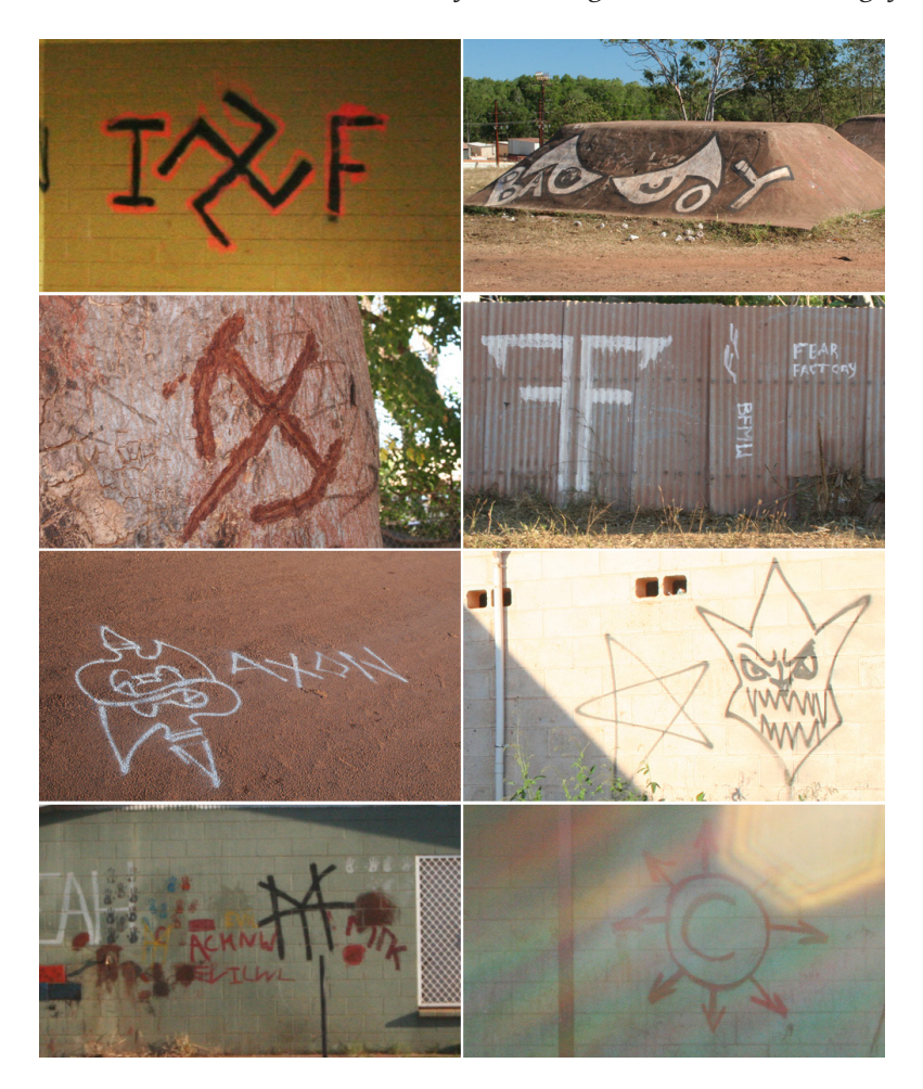
Figure 2: Graphic symbols of metal mobs, clockwise from top-left: German (swastika) + In Flames; Bad Boys (copied from a popular car sticker); Fear Factory (logo featured on album covers); Evil Warriors (devil image); Chimaria (logo featured on album covers); Machine Head (logo invented in Wadeye?); Saxon (logo featured on album covers); Judas Priest (device featured on album covers).

tell us about the meaning of metal at Wadeye. This is by necessity rather more interpretive than the previous section, since meanings, concepts and ideas cannot be observed directly. However it is clear that cultural circulation is not just a matter of travelling artefacts, but also, perhaps more interestingly, the meanings that travel with them.<sup>37</sup> Therefore it seems in order to make some comments here about what heavy metal might mean to kardu kigay.