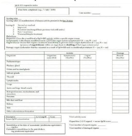
Figure 2: The IgG4-RD RI.

The questionnair consists of 4 questions each positive answer by yes is estimated to equal 1/4 of the point.