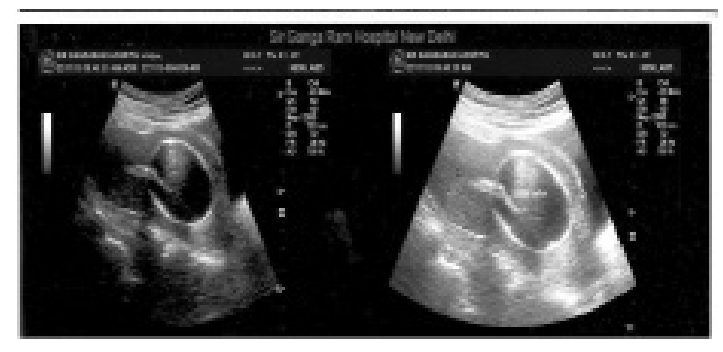
Figure 3: Foleys Balloon Tamponade.

treatment modalities involving medical, surgical, radiological approaches either alone or in combination [7]. Basic aim of treatment is prevention of life threatening hemorrhage, preservation of fertility and menstrual function since majority of the women with CSP would be in the reproductive age group.