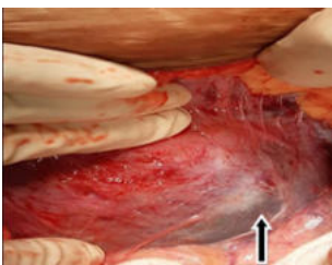
Fig 2: LSCS of same patient after 48 hours (dexamethasone coverage) showing thinned out lower uterine segment (scar thinning).