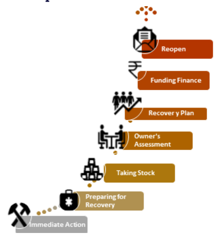
Figure.4: Steps in a business recovery process in the wake of the COVID-19 pandemic