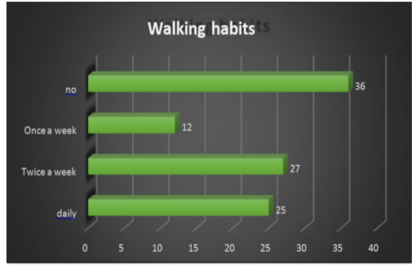
Fig 5: Life style Physical Activity in CVD samples

Table clearly states that 26% of the samples are in obese condition, 20% were overweight, 50% are normal in weight and 2% were underweight especially female samples belongs to underweight. Physical status of the sample's states that majority of the samples go for walking (25%) everyday, 27% twice a week. 12% once a week and 36% never go for any physical activity. The samples were recorded for weight loss after physical exercise and diet pattern the table explains 2% with weight gain and 26% with weight loss and 72% with no change.