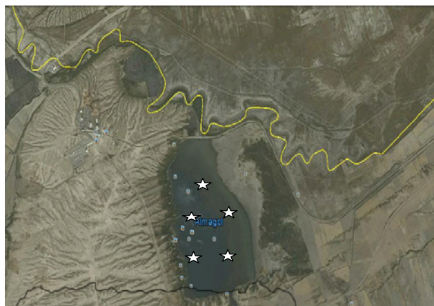
Figure 1: Location of Alma Gol wetland and situation of sampling stations.