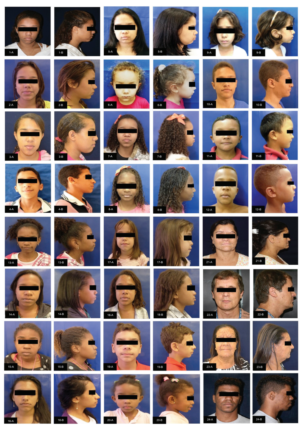
Fig. 1. A. Facial clinical aspects of the individuals with neurofibromatosis 1 (patient 1-24) Front (A) and lateral (B) views.