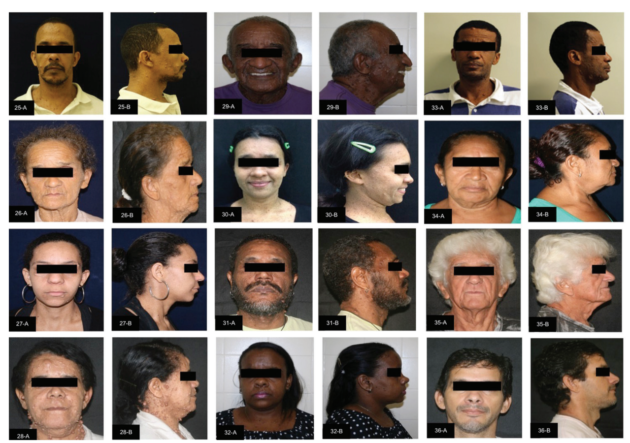
Fig. 1. B. Facial clinical aspects of the individuals with neurofibromatosis 1 (patient 25-36). Front (A) and lateral (B) views.