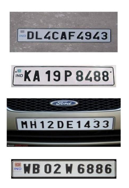
Figure 3: Images of Number Plates used for Template Matching