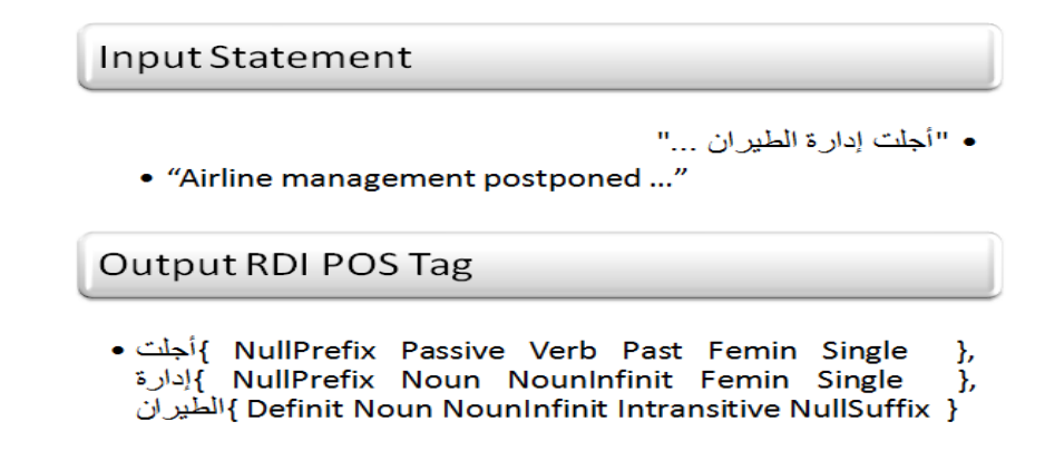
Figure 3. RDI Part Of Speech Tagging Example

Hence, we reduced this tag to a smaller tag set {Noun, Definite, Verb, Translit, Number, Symbol, and NA}. Any non-Arabic words (Latin letters, special characters...etc) are tagged as symbols. Definite class is any noun that is attached with a definite article prefix (ال). Translit class is dedicated for transliterated words. The RDI POS tagging in Figure 3 will be reduced to: