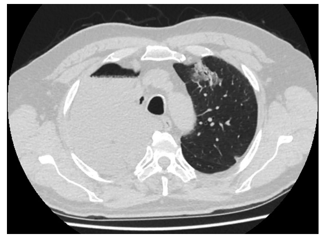
Figure 2. Peripherally located ground-glass opacity view of the upper lobe of left lung.