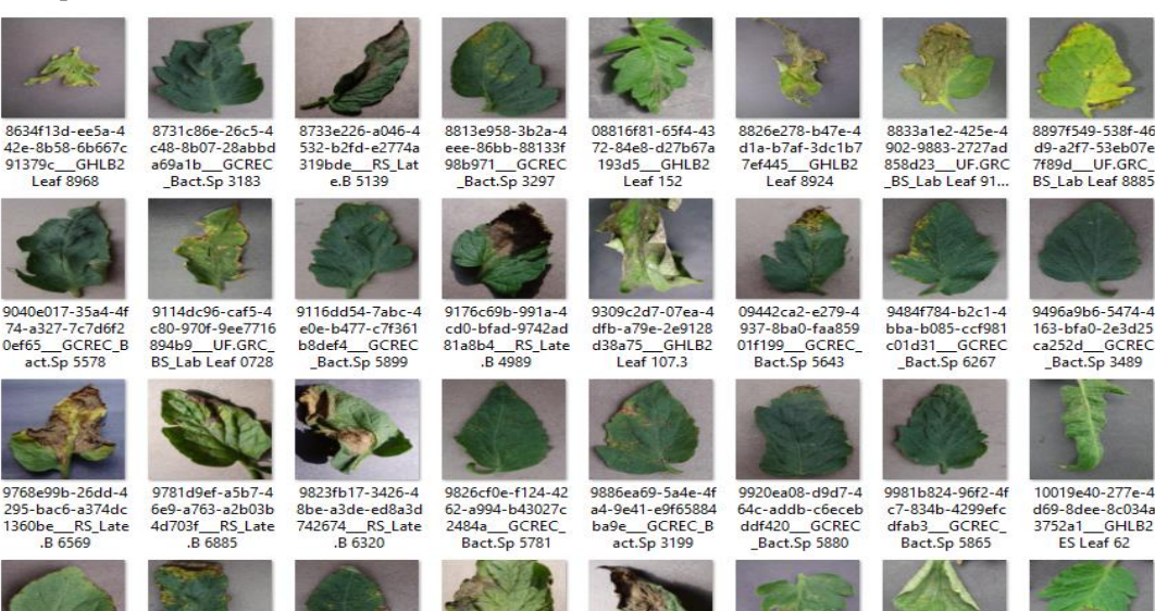
Figure 1: Data Set

These are the pictures of data set which is used to identify the disease and to train the machine for the detection purpose.