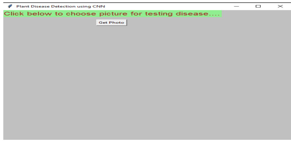
Figure 3: UI of the Application

It is the user interface (UI) of the application where we add the sample photograph of the plant leaf to detect the disease.